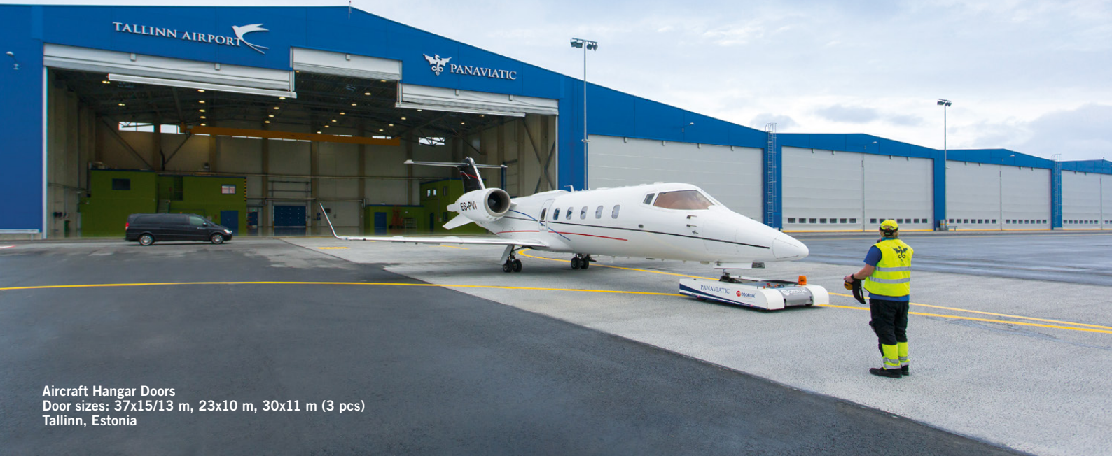
Aircraft Hangar Doors Door sizes: 37x15/13 m, 23x10 m, 30x11 m (3 pcs) Tallinn, Estonia

The innovative multi-leaf door system design with swing-up mullions permits to manufacture the door according to the aircraft fleet shape, with maximum space utilization.