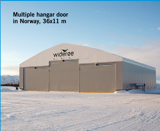
Multiple hangar door in Norway, 36x11 m