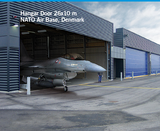
Hangar Door 26x10 m NATO Air Base, Denmark