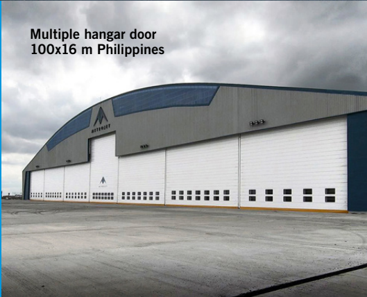
Multiple hangar door 100x16 m Philippines