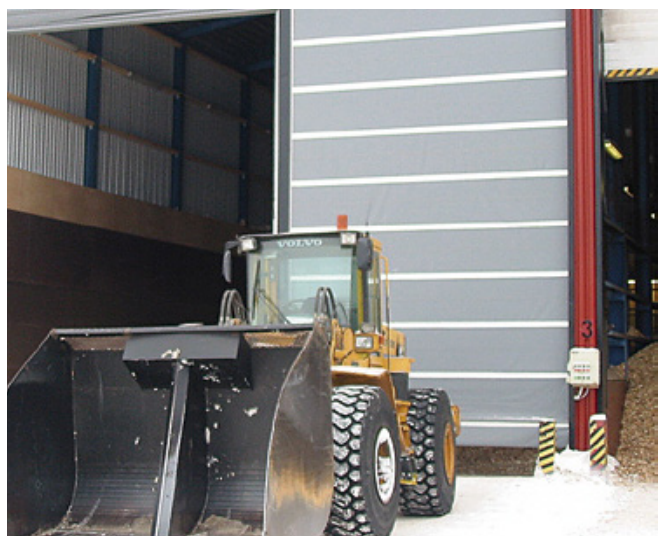
The door can be fitted with a motion detector, which makes it open and close automatically.