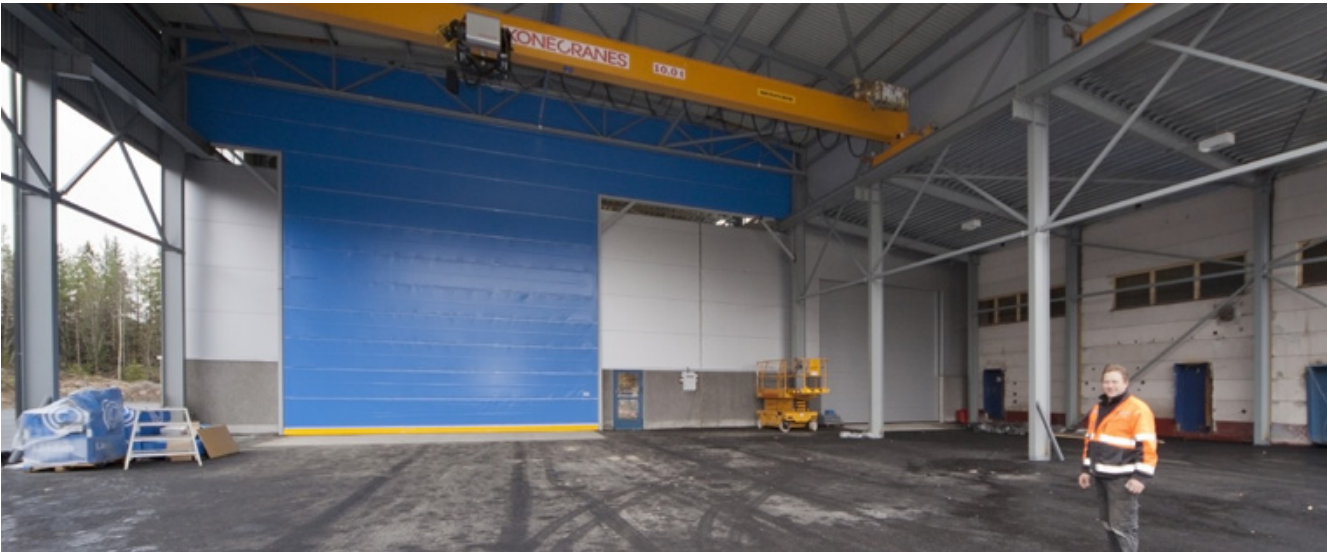
Champion Door craneway doors are extremely airtight compared to traditional door solutions.