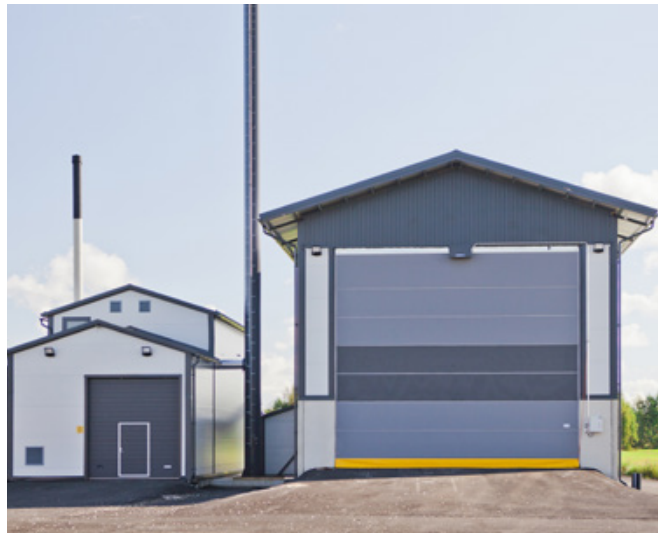
Using mesh modules allows more light into the building and improves ventilation. The dense mesh stops snow and rain from penetrating into the building.

A fabric fold-up door is a particularly reliable solution for the storage and handling of biofuels, such as wood, woodchips, peat and pellets. Champion Door's product range includes a door model particularly designed for dusty and dirty conditions. With lorry traffic in mind, there are various control options available for the doors, including radio, radar and pull switch control. Safety can be improved by an impact sensor at the lower edge or a mirror photocell, for example. Some of the fabric can be replaced by mesh, which helps to reduce the effect of wind loads on the door. At the same time, the mesh lets light through and improves ventilation, which is important for woodchip storage, for example. The door can also be fitted with a transparent PVC window.