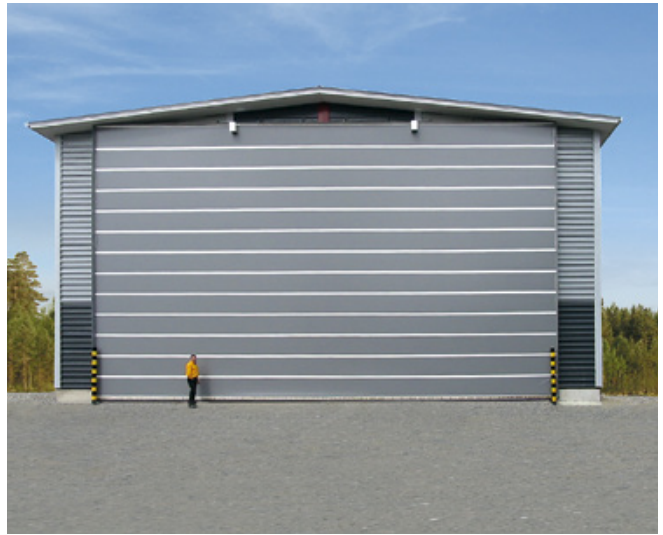
With its rigid frame, the NK2 Double is an excellent solution for energy storage. The door is also available with a reliable frame structure designed specifically for dusty areas.

A fabric fold-up door is a particularly reliable solution for the storage and handling of biofuels, such as wood, woodchips, peat and pellets. Champion Door's product range includes a door model particularly designed for dusty and dirty conditions. With lorry traffic in mind, there are various control options available for the doors, including radio, radar and pull switch control. Safety can be improved by an impact sensor at the lower edge or a mirror photocell, for example. Some of the fabric can be replaced by mesh, which helps to reduce the effect of wind loads on the door. At the same time, the mesh lets light through and improves ventilation, which is important for woodchip storage, for example. The door can also be fitted with a transparent PVC window.