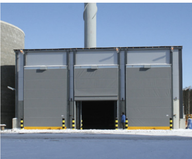
Champion Door fabric fold-up doors are highly reliable in cold conditions.